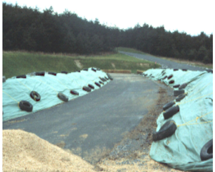
Figure 1. Composting mortality windrows covered with a water-repelling compost fleece. If discarded tires are used to anchor the fleece in place, they should be cut in such a way that they do not retain rainwater.

spreading equipment, as it will likely be torn during removal of the windrow. Temporary concrete barriers commonly used with highway construction projects or large hay bales have been successfully used to create a channel for compost containment. Protect open air piles from prolonged contact with rainwater with a covering that repels water, such as composting fleece or a plastic tarpaulin. Figure 1 illustrates the use of a composting fleece. A well-rounded windrow also will aid the shedding of rainwater.